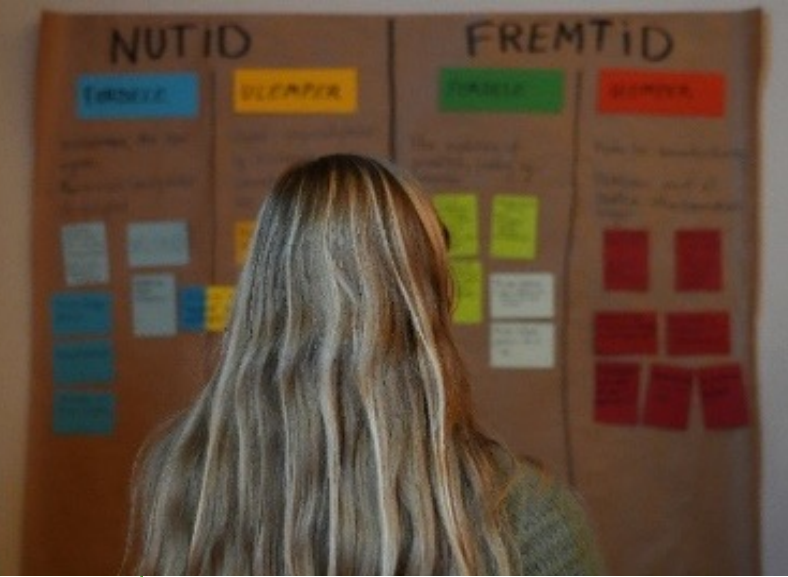
Looking at the results of the vision development session